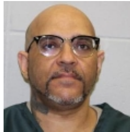
Front with Glasses