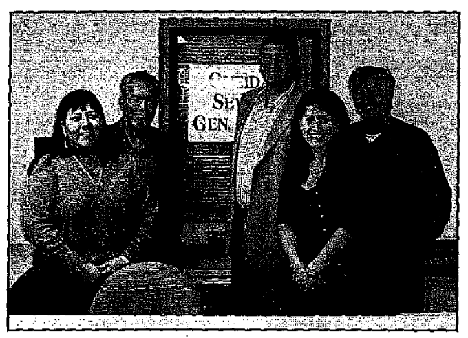
Seven Generations Staff