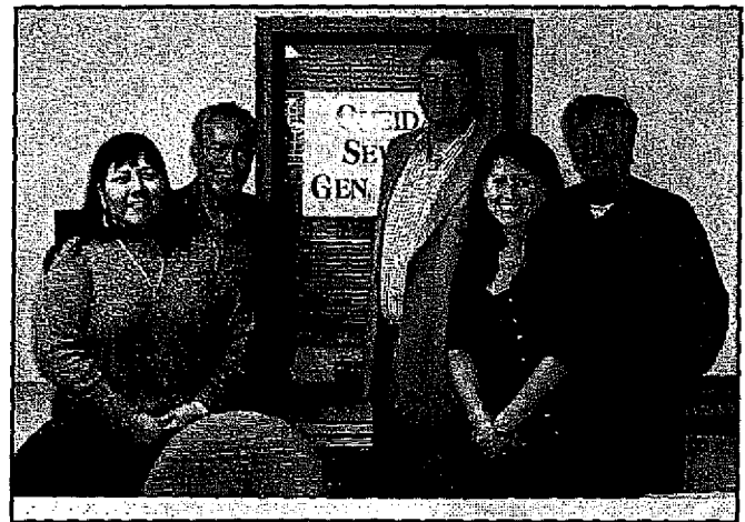
Seven Generations Staff