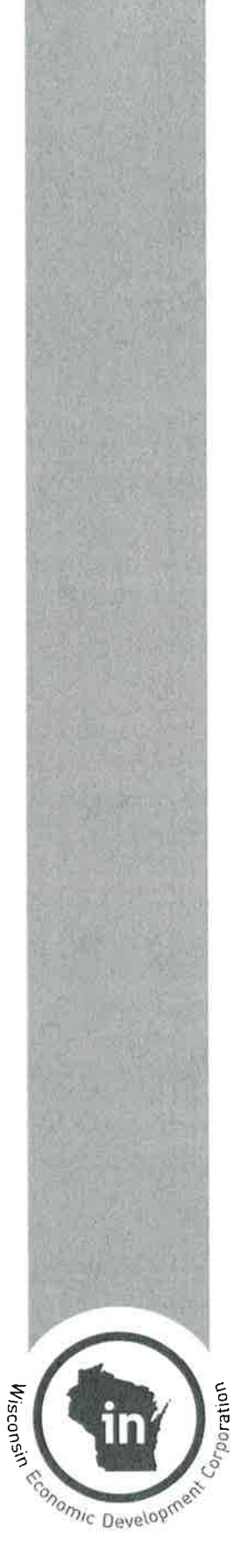
Chief Legal Counsel

201 W. Washington Avenue Madison, WI 53703